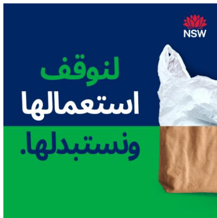
Tile: 'Plastic ban Stop it and swap it Bags_1080x1080 - Arabic.jpg'

Here are some examples of the translated social tiles and posts for you to share, available in this Google Drive , so you can spread the word about the lightweight plastic bag ban in Arabic, Greek, Vietnamese and Chinese Simplified and Traditional.