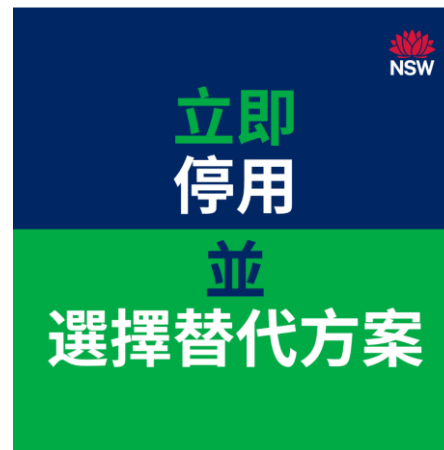
Tile: 'Plastic ban Stop it and swap it Bags_1200x1200px - Chinese (Traditional).jpg'