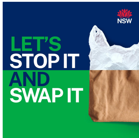
Tile: 'Plastic ban Stop it and swap it Bags_1080x1080.jpg'

Here are some examples of the social tiles for you to share, available in this Google Drive , so you can spread the word about the lightweight plastic bag ban. More tiles, including GIFs, will be added into this Drive shortly.