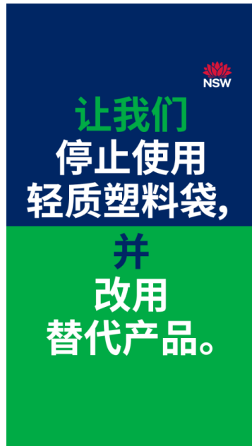
Tile: 'Plastic ban Stop it and swap it Bags_1080x1920px - Chinese (Simplified).jpg'