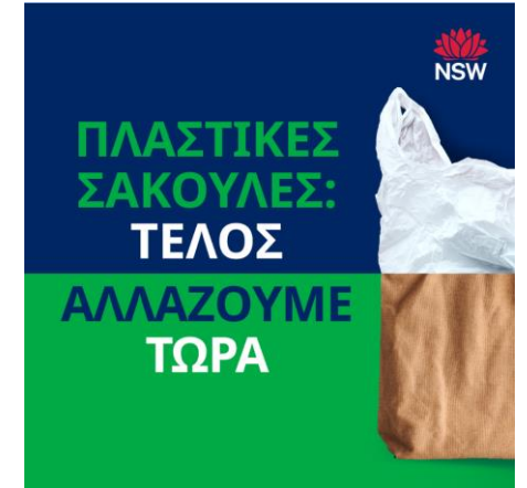
Tile: 'Plastic ban Stop it and swap it Bags_1080x1080 - Greek.jpg'