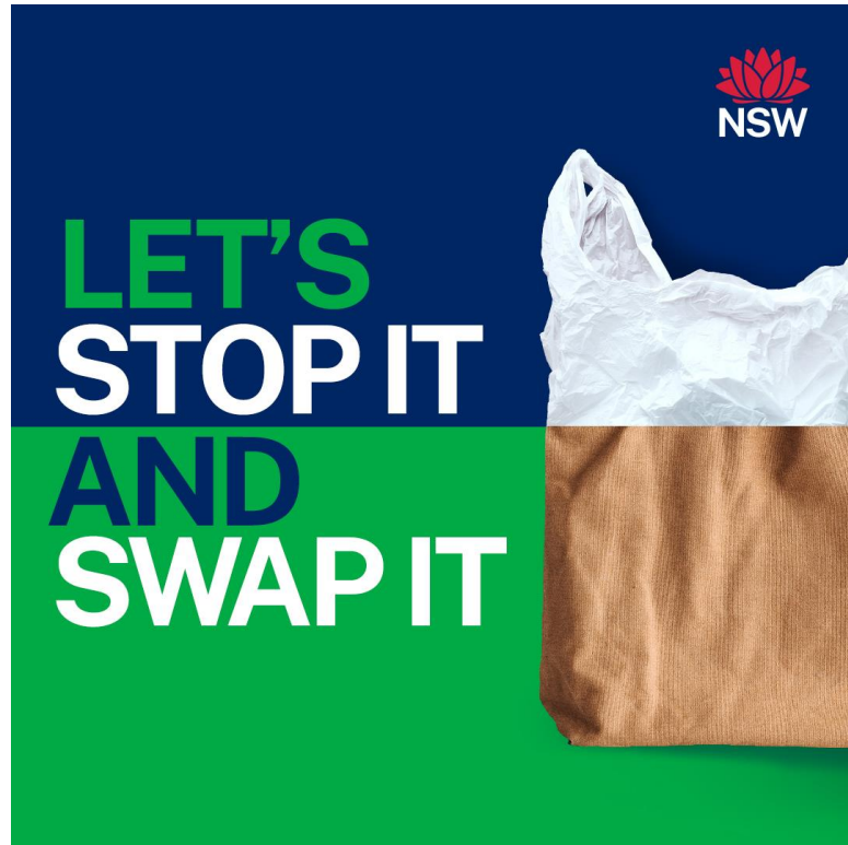
Tile: 'Plastic ban Stop it and swap it Bags_1080x1080.jpg'