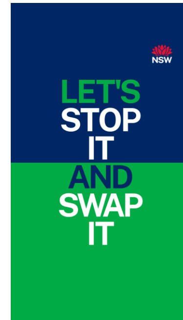
Tile: 'Plastic ban Stop it and swap it_1080x1920px.jpg'