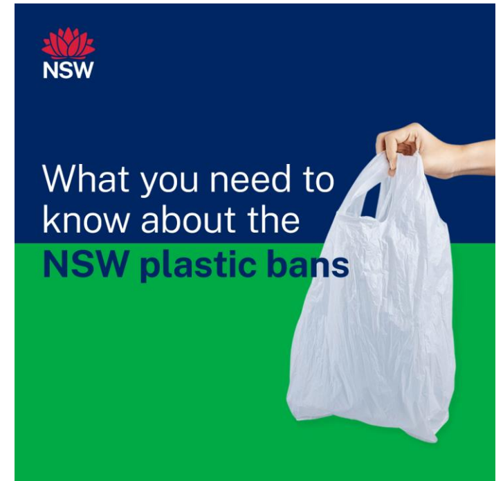
Tile: 'Plastic ban What you need to know.JPG'