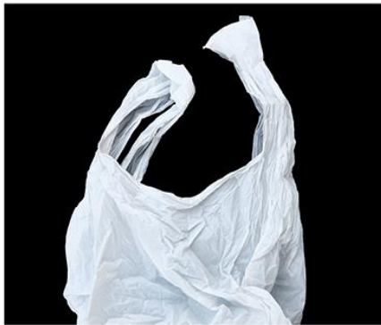
Lightweight plastic shopping bags