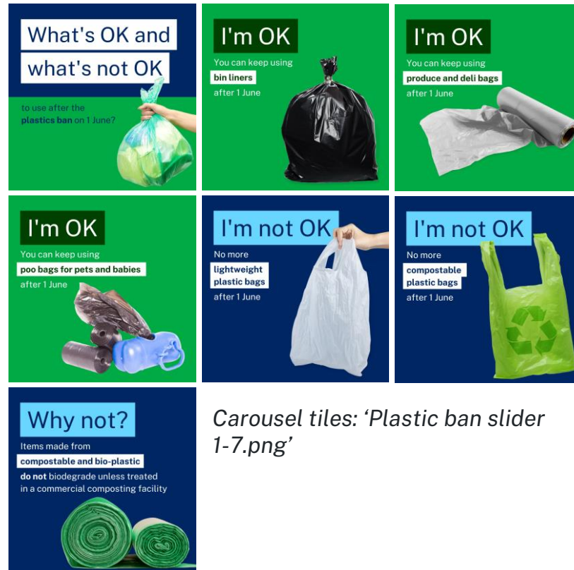
Carousel tiles: 'Plastic ban slider 1-7.png'