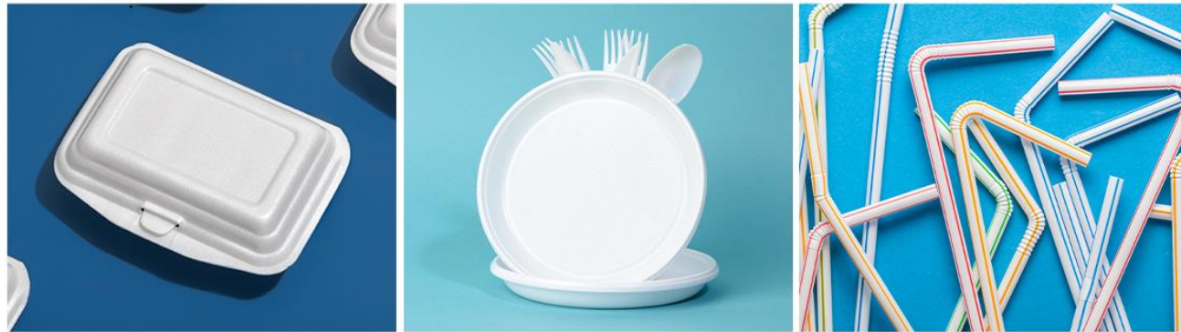
Expanded polystyrene foodware