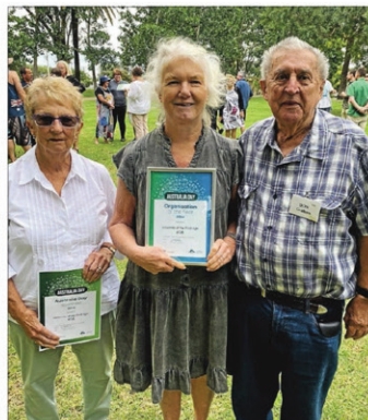
Representatives from Leeton's USA with their organisation of the year award (left), with (top) St Francis College students and supervisors after winning the group of the year and event organisers of the Leeton Pride Festival after taking out the event of the year.

SCHOOL students, Leeton's first ever pride festival and a group aimed at equipping older residents with knowledge all found it hard to believe they had been recognised in the town's Australia Day honours. In 2024, St Francis College student boarders took out the group of the year accolade, while the Leeton Pride Festival was named the event of the year. Leeton's University of the Third Age group was honoured to be awarded the organisation of the year. The three categories were hotly-contested in 2024, but the trio of organisations were described as being a representation of all corners of the community. The St Francis College students took out the title for their volunteer work at Assumption Villa, which is set to continue this year. Meanwhile, Leeton's first-ever Pride Festival had its organisers surprised to