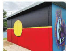
A glimpse of part of the mural.