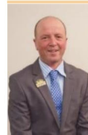
Cr Tony Ciccia Elected to Council 2016