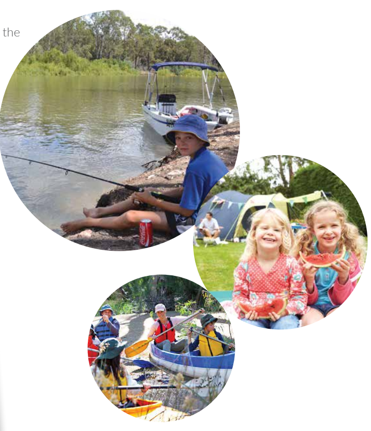
Embracing the paddock to plate movement is a highlight of the Leeton community. Local growers, restaurants, cafes and farmers markets collaborate to bring the freshest local produce to the community.