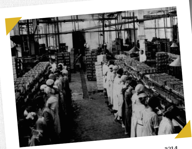
The Letona cannery opened at Lecton in 1914.