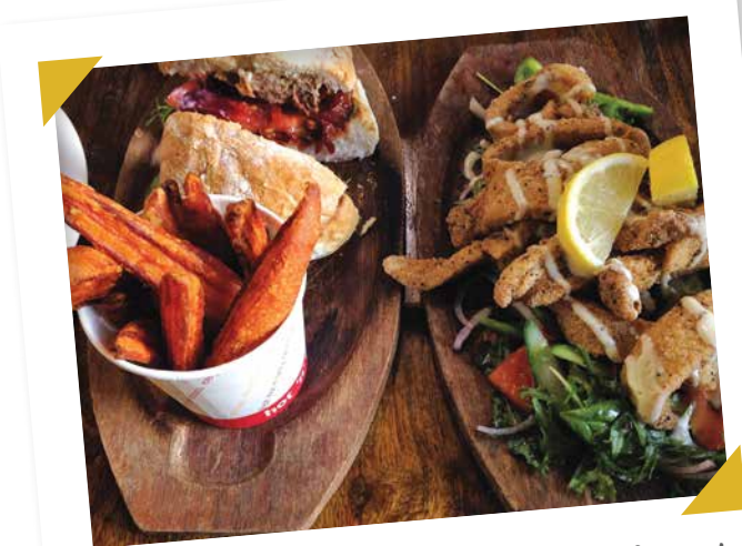
The paddock to plate attitude increases productivity and decreases the cost of doing business.

Surrounded by the natural wonder of RAMSAR listed wetlands, Fivebough and Tuckerbil, the Murrumbidgee National Park and the magnificent Murrumbidgee River, outdoor adventures are at their finest. On the weekends, the Shire is abuzz with camping, cycling, hiking, fishing, canoeing and kayaking.