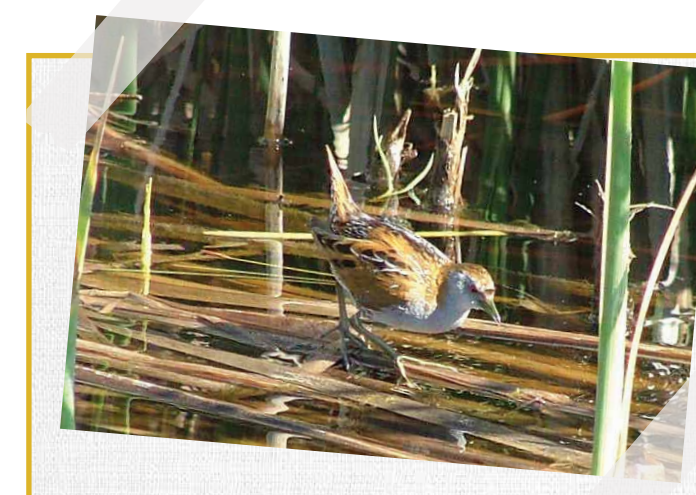
Our wetlands have approximately 86 identified species of waterbirds, including some of Australia's rare and endangered species, such as the Brolga.