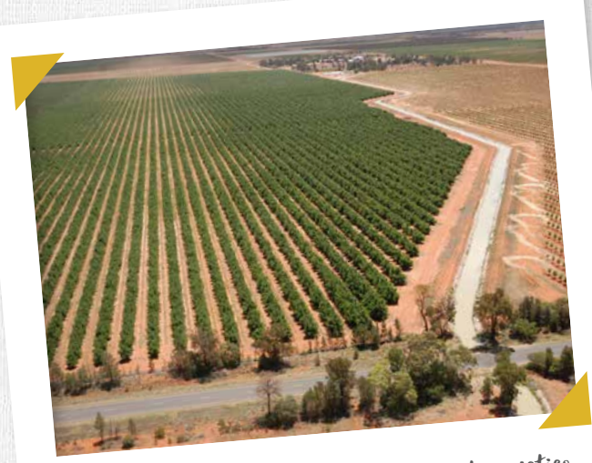
Webster produces a number of different varieties aimed at maximising yield and quality.

Vertical integration begins at Leeton's walnut nursery, which is the largest in Australia. The nursery produces vigorous, high yielding cultivars (Chandler, Howard, Vina, Lara, Ashley, Tulare and Serr) and pollinisers (Fernette and Cisco). These varieties need to be capable of higher yields, produce good light colour quality kernels and mature over a period of time in order to spread the harvest period.