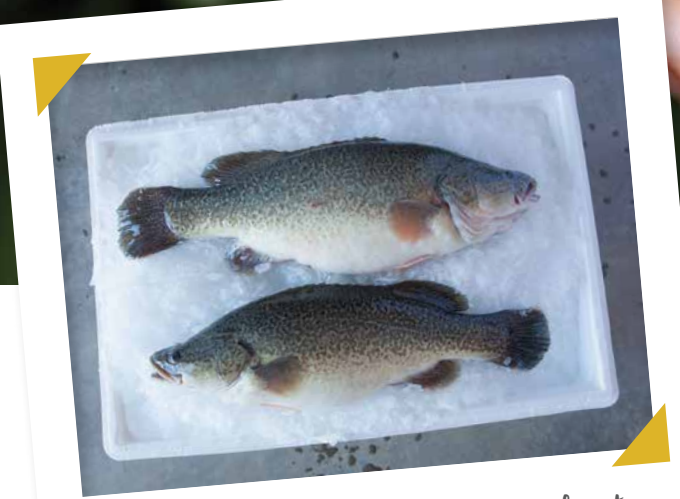
Nid you know that Murray cod is farmed in its native water within the Lecton shire?

eeton is not just another rural town; it is an impressive manufacturing hub adding enormous value to the agricultural sector. Leeton continues to push ahead, welcoming technological advances and supporting initiatives for competitive advantage. We have excellent education and research facilities, and provide varied career opportunities including growing, processing, manufacturing, infrastructure, servicing, health and education, retail, and affordable environments for startups.