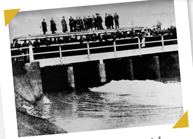
"Turning on the tap" at the Murrumbidgee Irrigation Settlement in the Riverina in 1912.