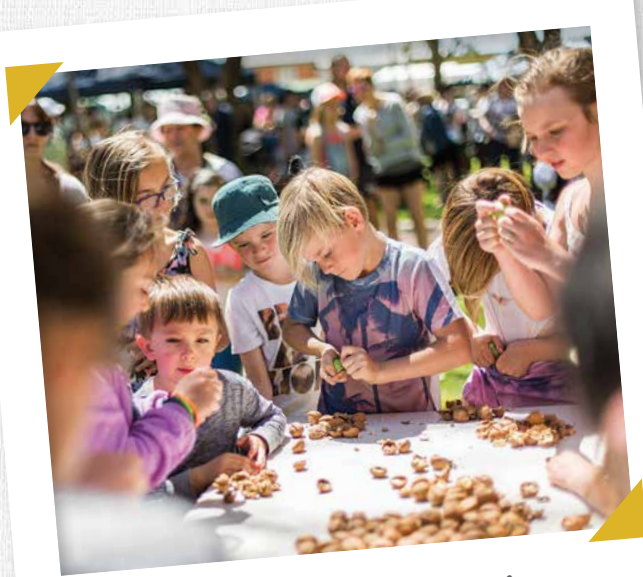
Lecton Chill and Grill is just one of the many great events held in the region.