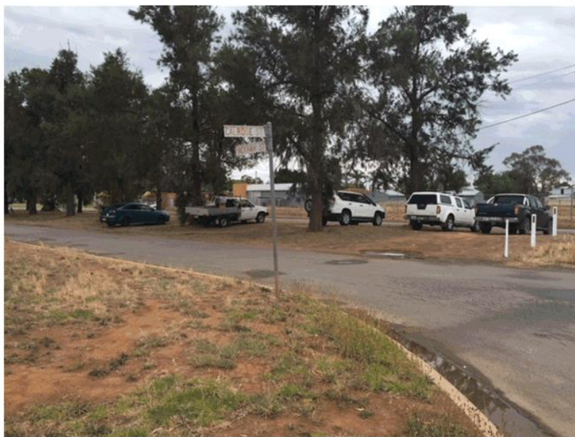
Vehicles parked on the nature strip in Packham Street